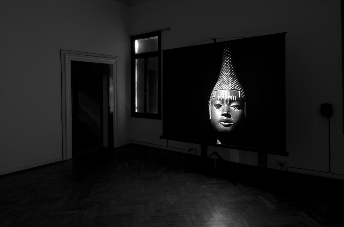
fig. 3 Chris Marker and Alain Resnais, Les Statues meurent aussi ( Statues Also Die ), 1953/2014; Installation view, The Common Guild, 55th Venice Biennale 2013.