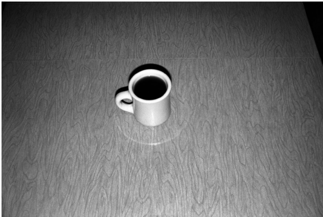
fig. 6 Duncan Campbell, It for Others , 2013; Still from 16mm and analogue video transferred to digital video, 54 min.