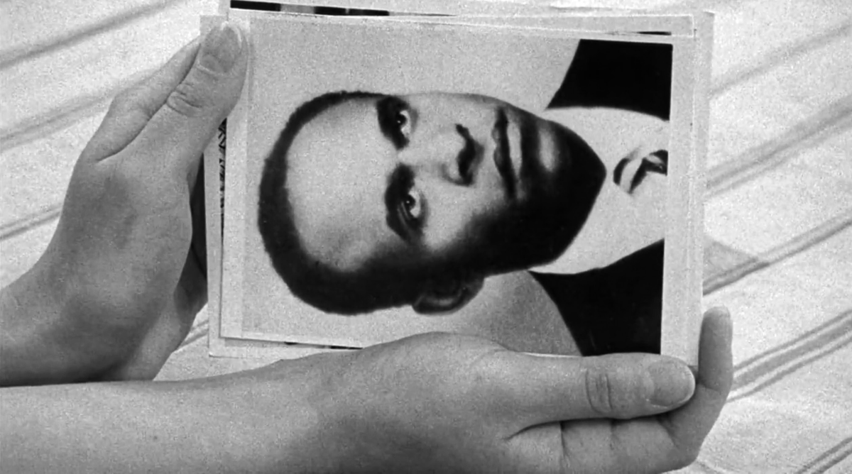
fig. 5 Duncan Campbell. It for Others . 2013; 16mm and analogue video transferred to digital video, 54 min.