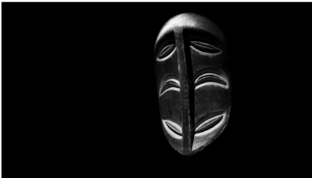
fig. 4 Duncan Campbell, It for Others , 2013; still from 16mm and analogue video transferred to digital video, 54 min.