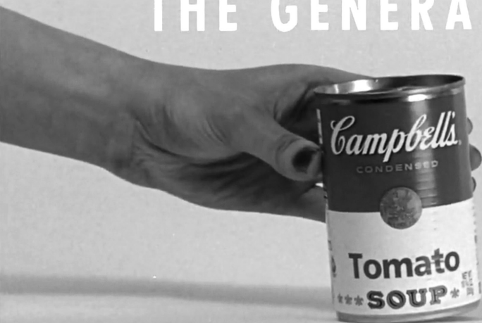
fig. 8 Duncan Campbell, It for Others , 2013; Still from 16mm and analogue video transferred to digital video, 54 min.